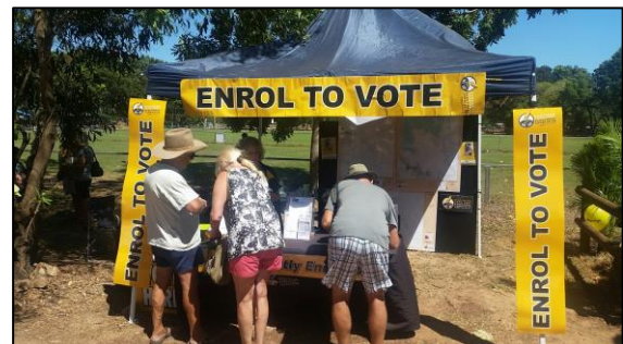
Freds Pass show 2016

The NTEC will also be encouraging Territorians to ensure they are correctly enrolled for the 2017 NT Council elections at the Alice Springs, Darwin, Katherine and Tennant Creek shows.